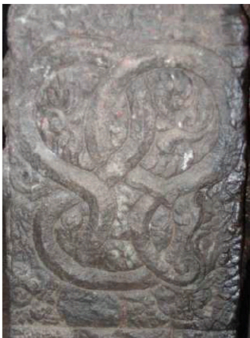
Figure 3. A prime knot with six crossings, the Stevedore's knot, found in the Marundheeswarar temple.

Knots have been the object of mathematical and scientific interest since Lord Kelvin studied these in the latter half of the nineteenth century as a model of atoms.